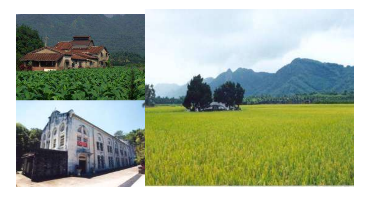
1: Meinong Society and Production Sites. 2010/6/30