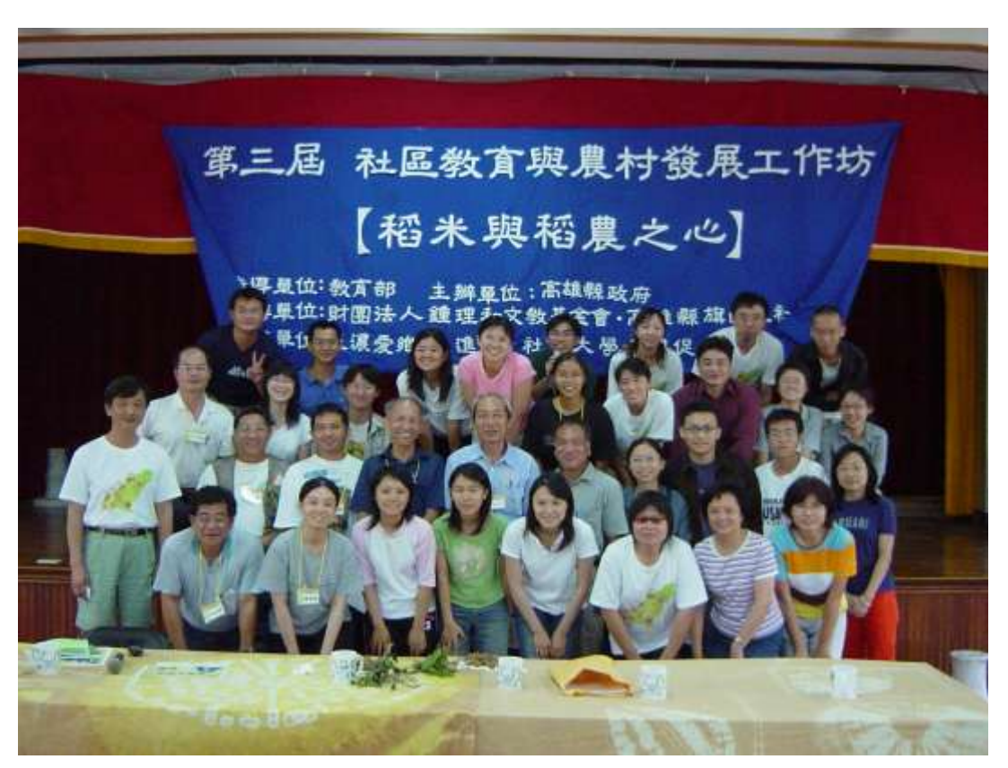
9: Cimei Community College Community Education and Rural Development Workshop 2004/8/2