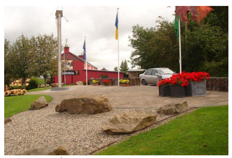
Éan Fionn sculpture on the Village Green

In the heart of Birdhill, a tall stainless steel sculpture of the Éan Fionn stands sentinel over the village green. It celebrates the legend of Oisin who defeated a giant destructive bird - a modern representation of an ancient tale, truly reflecting Birdhill's connection between past and present.