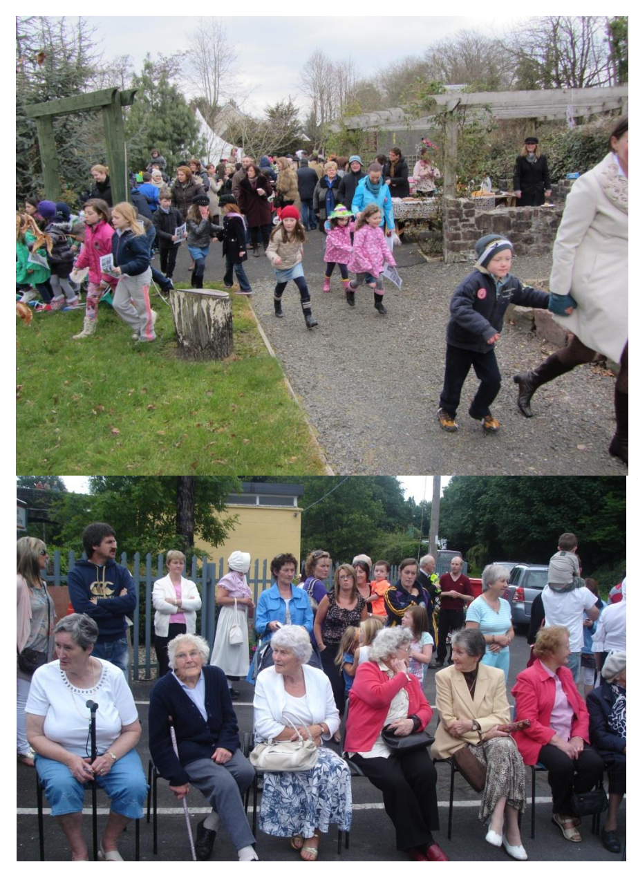
Birdhill has something for young and not so young

and plant contributes to the health of the community. And for those who prefer a different pace, the community offers activities such as yoga and pilates which provide opportunities to reconnect with our inner spirituality while not forgetting daily Mass in our local church as a spiritual and social resource.