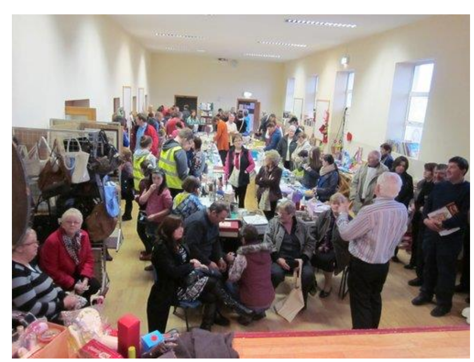
Fundraiser in the Community Hall

Although Birdhill is forever at a crossroads, it is not solely a place to choose a direction by which to leave, but through the ages it has also offered a destination. Birdhill combines the traditions of the past with the efficiencies of the present, the solitude of a rural location with the support of a vibrant community, sustenance for the body and space for the soul. Birdhill has a long history, from mythical times to a 19<sup>th</sup> century traveller's resting place. Birdhill's past and present combine for a bright future made by its people acting together for the betterment of all.