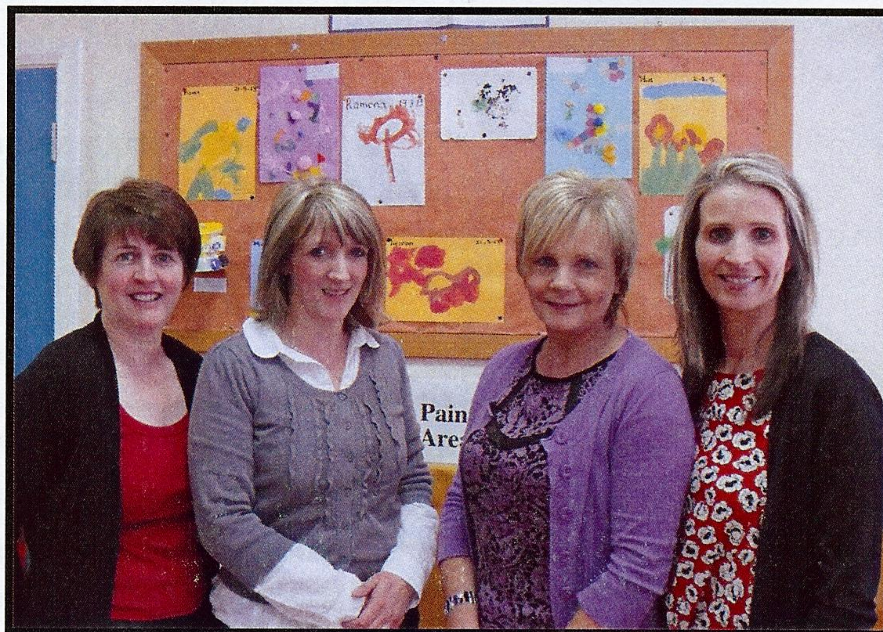
Park Community Playgroup High Scope Accreditation 2012