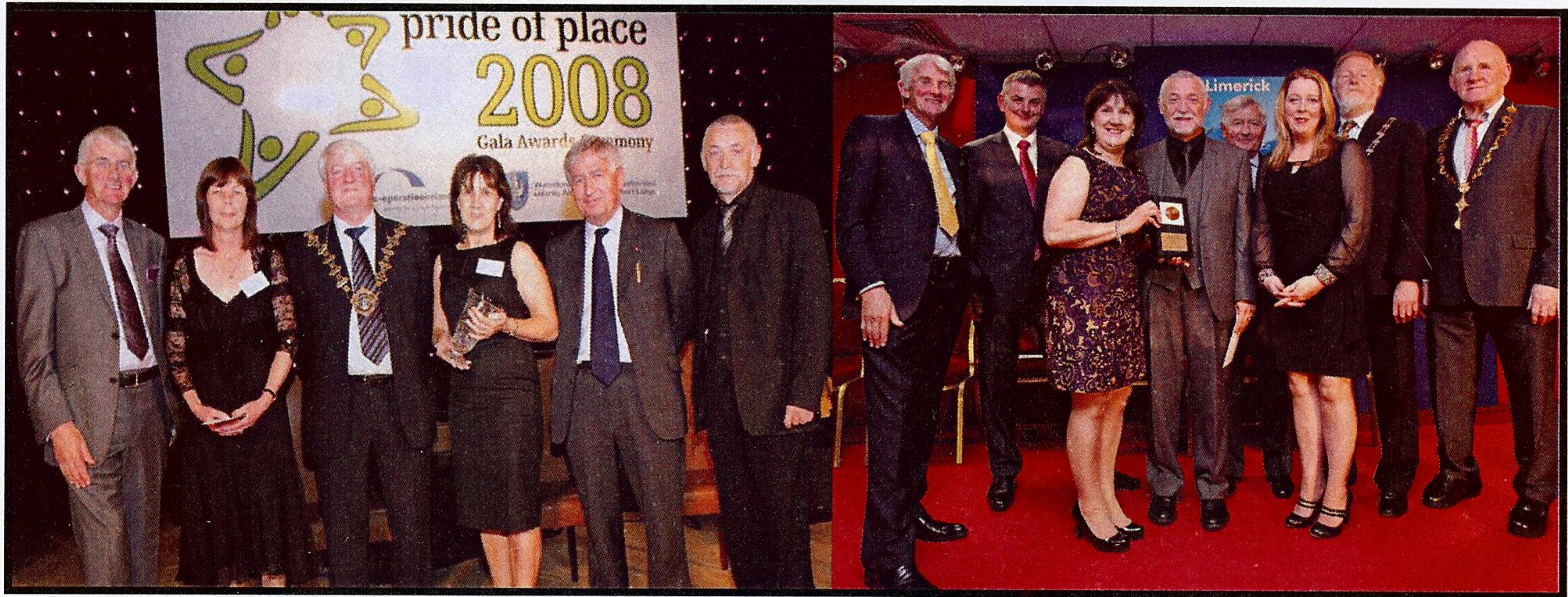
Pride of Place Competition Park Village Runners up - 2008 & 2012